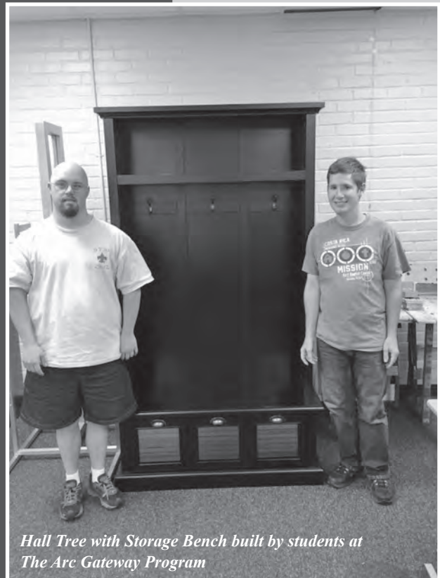
Hall Tree with Storage Bench built by students at The Arc Gateway Program

PARADE OF HOMES HOME BUILDERS ASSOCIATION OF WEST FLORIDA